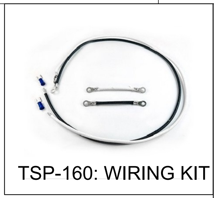
TSP-160: WIRING KIT