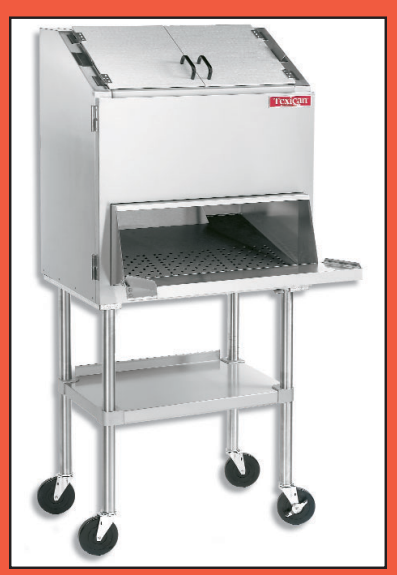
When the cabinet is mounted on our portable stand it gives the operator location options and mobility. (See Model TSS for size)

The entire front door assembly swings open for cleaning. Just unsnap the latches, remove the perforated interior bottom panel and wipe down the interior surfaces. Daily cleaning ensures fresh chips every day.