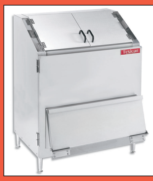
Serving cabinet shown with optional .250" thick anodized aluminum loading doors. A must for chain operators. Clear Lexan doors are standard equipment.

Rugged stainless steel construction with high density insulation means years of trouble free service.