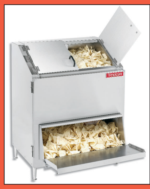
The lower access door opens to form a shelf, easing the serving of chips into baskets and reducing breakage.